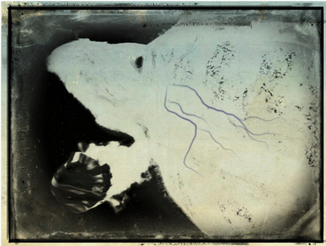
Hubble Finds a Star Eating a Planet

"Hubble Finds a Star Eating a Planet" Copyright 2013 Rohit, used under a Creative Commons Attribution license: http://creativecommons.org/licenses/by/3.0/deed.en_US