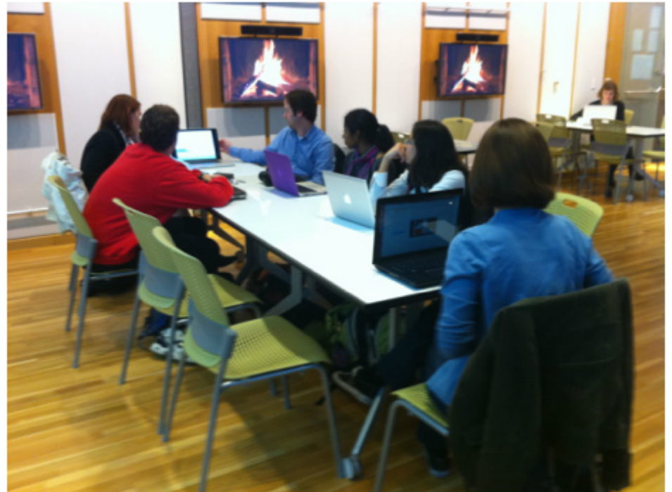
Get CC Savvy Workshop Students Watching a Challenge Video and Discussing