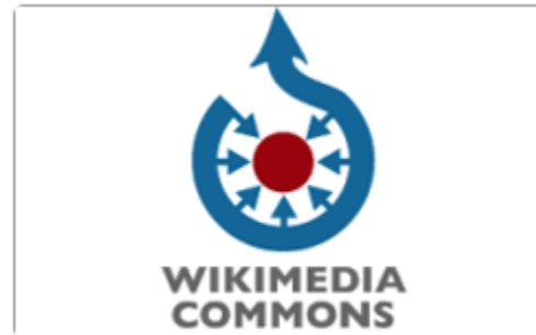
Contributing to Wikimedia Commons