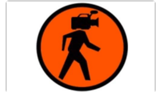
A Look at Open Video