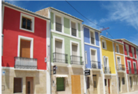
Intro to Openness in Education